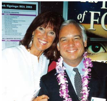
Janet and Jack Canfield

about how The Passions of Real Life Legends came to be.