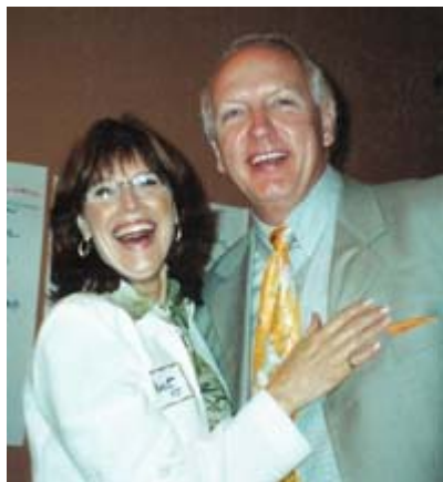
Janet and Mark Victor Hansen